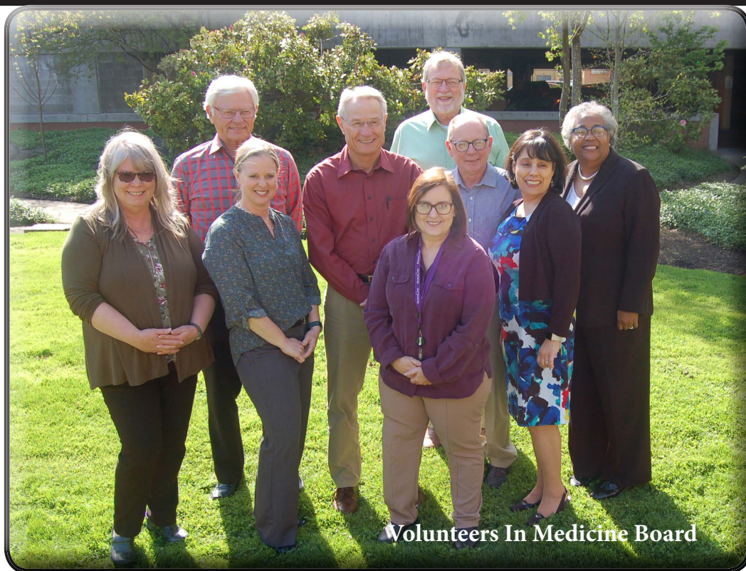
Volunteers In Medicine Board

VOLUNTEERS IN MEDICINE CLINIC 2260 Marcola Road Springfield OR 97477